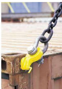
Container lifting lug CLB