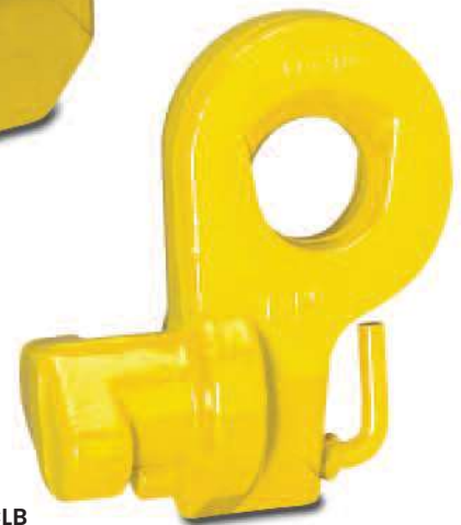
CLB for side lifting