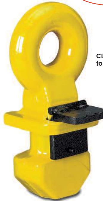
CLT for top lifting