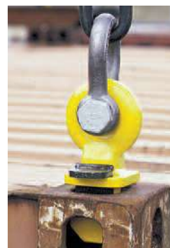
Container lifting lug CLT